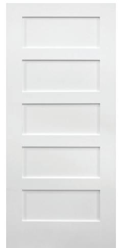
9755 | Flat