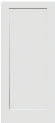
9720 | Flat