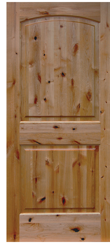
9083 | Raised