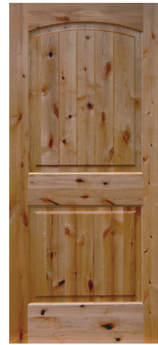
9083V | Raised V-GROOVE