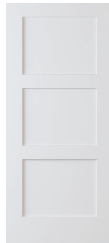
9730 | Flat