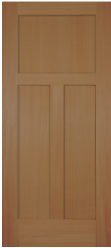
9760 | Flat