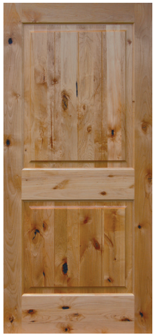
9082V | Raised V-GROOVE