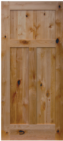
9760 | Flat ★ ⊕