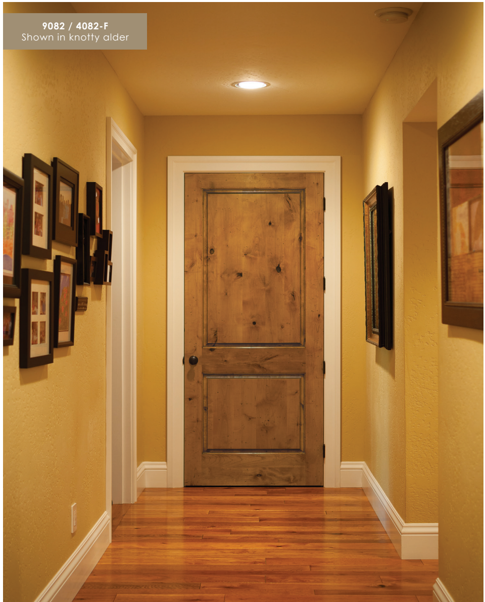
9082 / 4082-F Shown in knotty alder