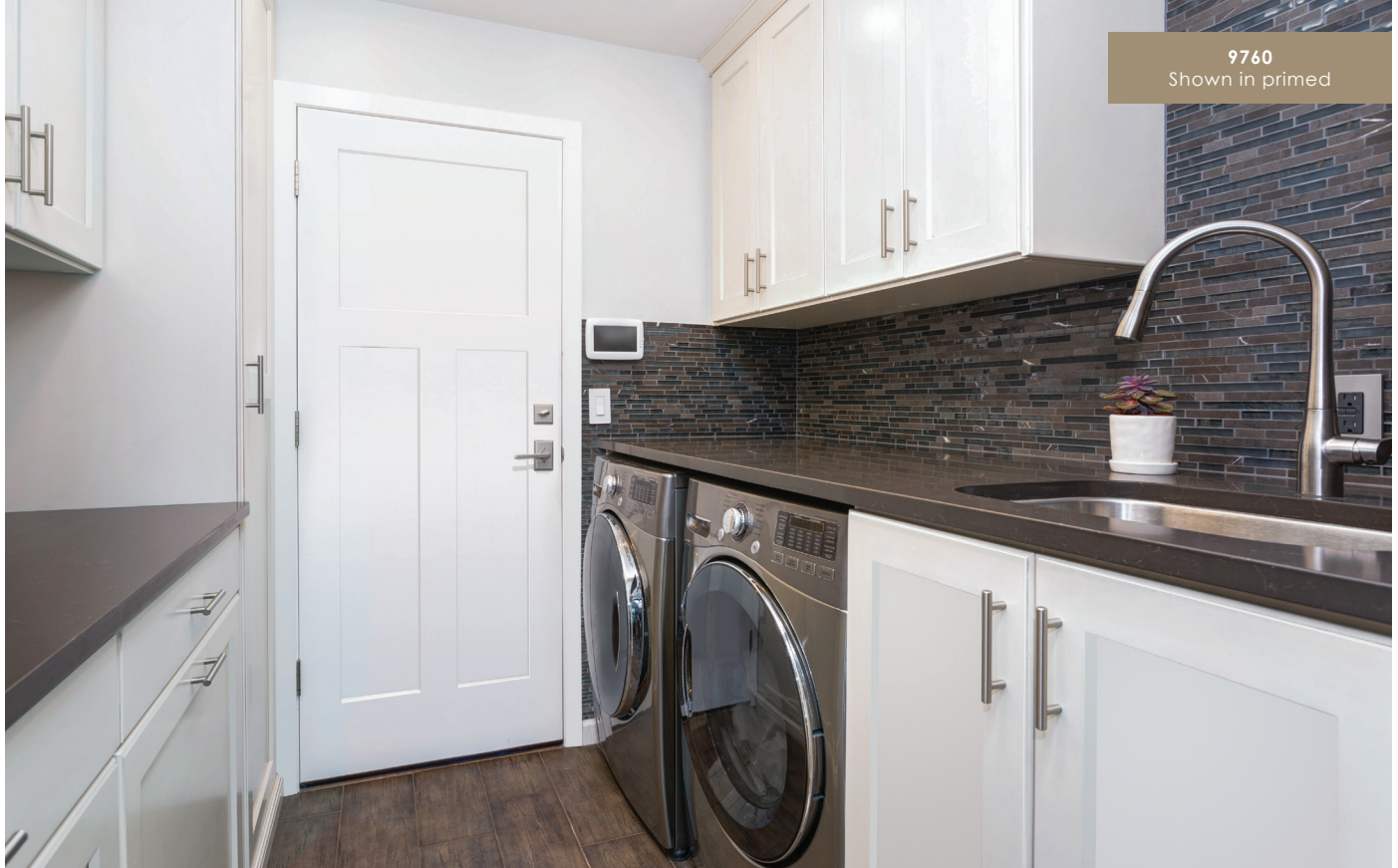
9760 Shown in primed