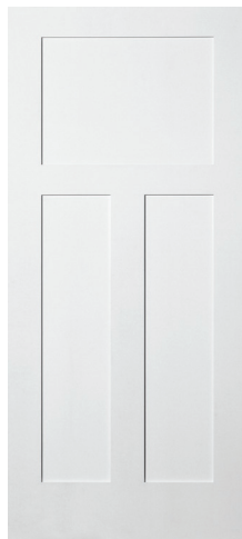
9760 | Flat